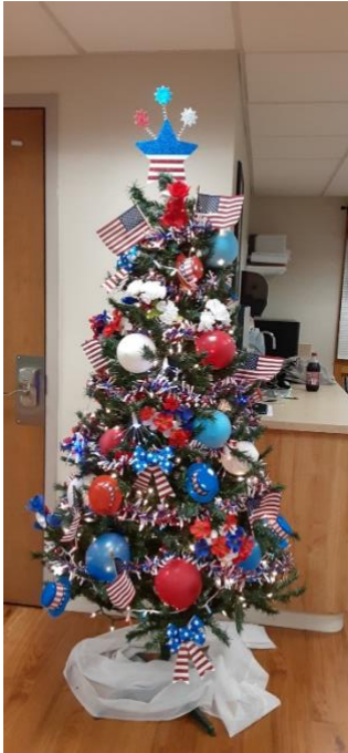
PATRIOTIC TREE IN RESTORATIVE ROOM; DECORATED BY KIM CUTRIGHT AND MARLENEA FINDLEY.