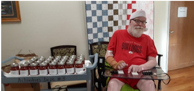
Residents Council sale was a SUCCESS!! It was held on Friday December 9 from 10:30 till 1:00. Many thanks to all who helped and participated!