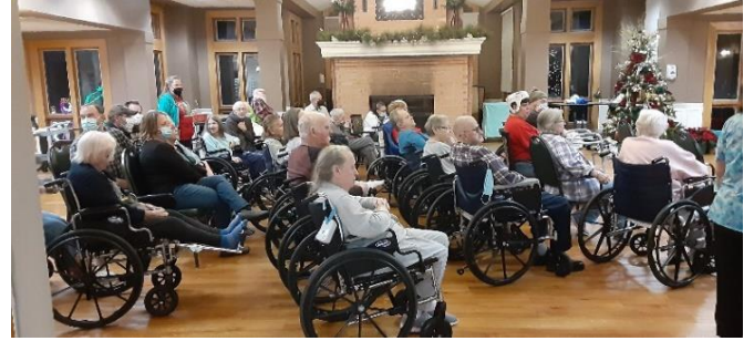
With Heart of Worship Prase Band from FUMC