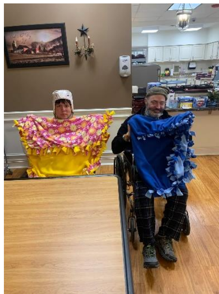
TIE BLANKETS FOR BLESSING BOX