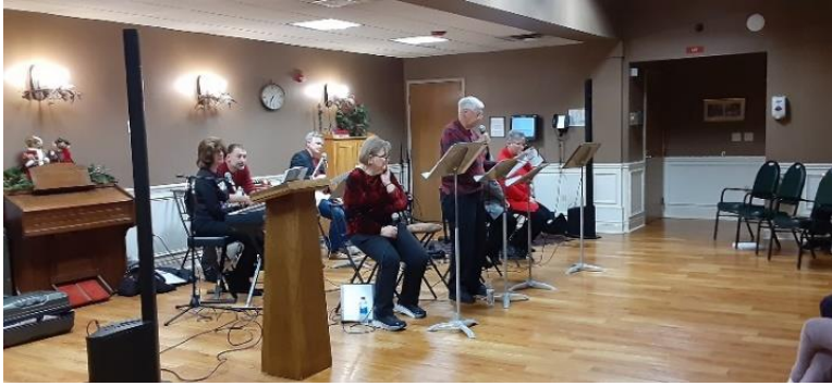
CANDLELIGHT SERVICE 12-15-22