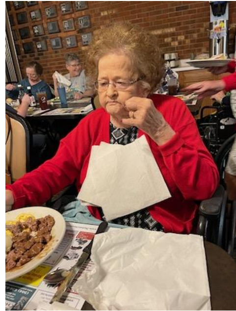
OUR RESIDENTS ENJOY DINING OUT. THEY WENT TO WESTERN STEER ON FEBRUARY 16.