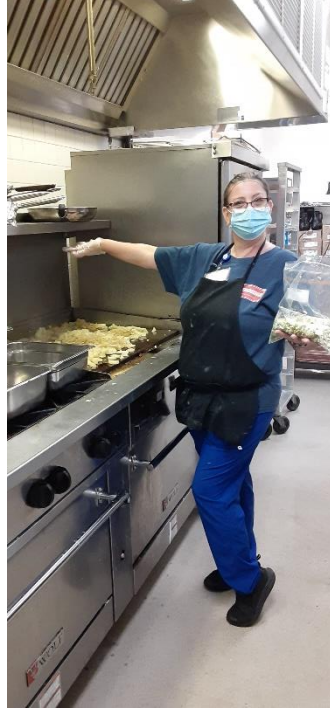
RAMPS, RAMPS, AND MORE RAMPS