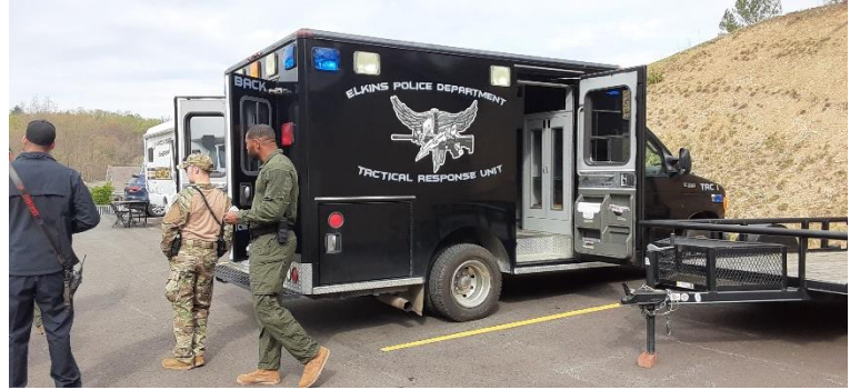
Getting ready for the Active Shooter Drill (4/26)