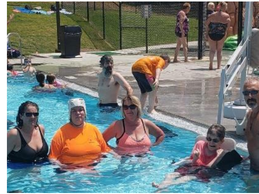
A Day at the Pool/Spash Pad