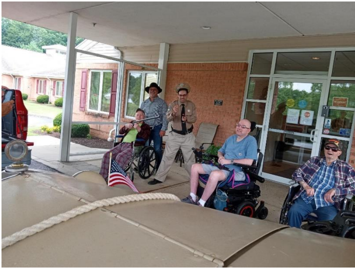
The residents enjoyed seeing the Beverly Hillbilly Truck. It was brought to our facility on July 29 after being in the Beverly Days Parade in Beverly, WV.