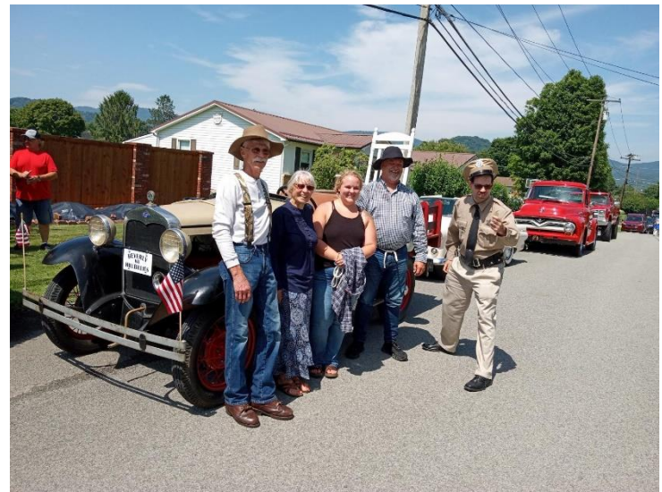
They loaded up the truck and came to ERCC!

*****EXTRA INFO: RESIDENTS' COUNCIL LUNCH BOX SALE WAS A HUGE SUCCESS!!