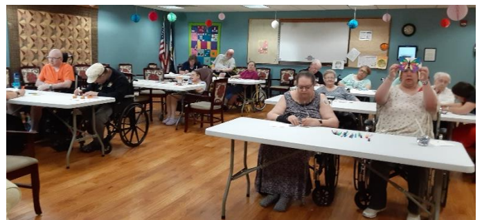
Flying butterflies with Old Brick. 8-25-23