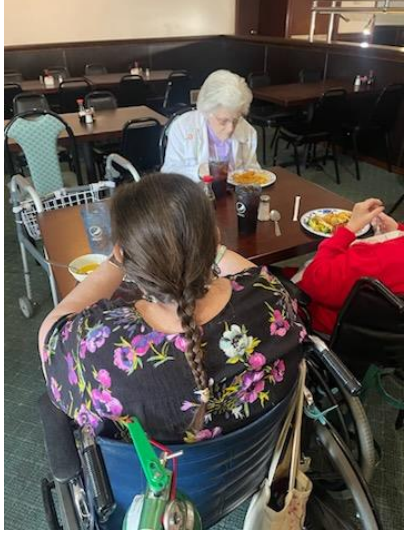
Residents outing at the new China Cook-9/28/23