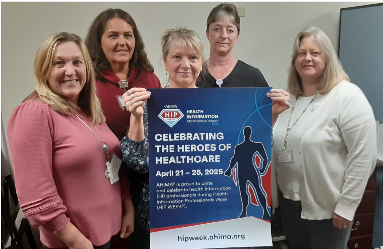
HEALTH INFORMATION MANAGEMENT TEAM

Health Information Professionals Week is scheduled for April 21-25. Health information assistants are crucial for keeping residents data in order by ensuring it is updated, accurate, secure and accessible. They handle sensitive and confidential information. The motto and aim of HIM is to "keep information human".