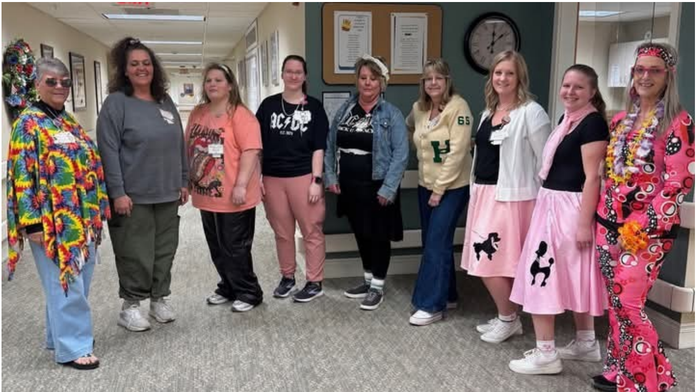
Our staff enjoys working at ERCC, especially on Throwback Thursday! Dayshift group is pictured above and nightshift is pictured below.