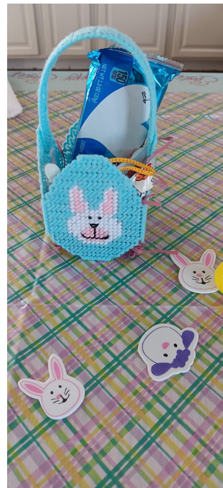
Table decorations for Easter in Reflections. The staff enjoys doing/making holiday items and the residents enjoy them. We at ERCC hope all had a safe and happy Easter Holiday.